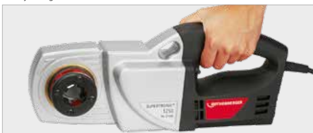
Small head shape (11 cm)

Ideal for portable operation due to its compact design and weight of only 4.9 kg