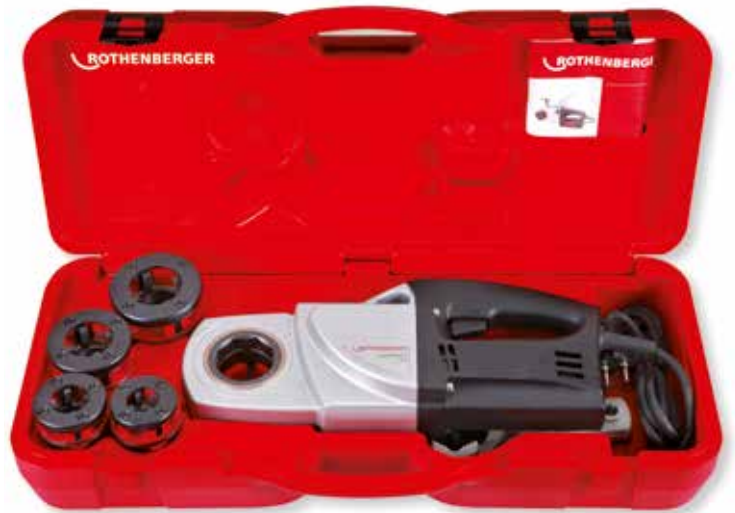
Fig. SUPERTRONIC 1250 set (No. 71450)