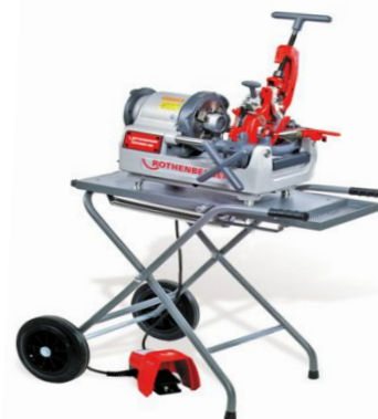
Collapsible Stand (56051) - Optional