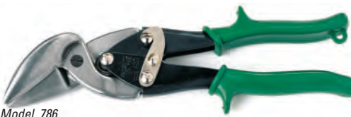
Model 786 Aviation Snips (cuts right)