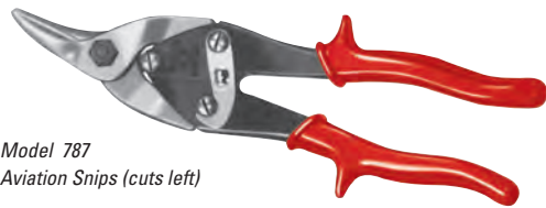
Model 787 Aviation Snips (cuts left)