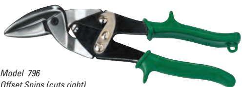
Model 796 Offset Snips (cuts right)