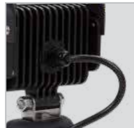
Finned design offers excellent heat dissipation