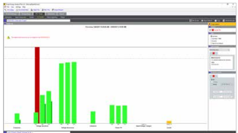
Fluke Energy Analyze Plus: Power quality health summary