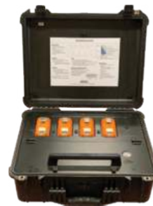
Bump/Cal Test Station